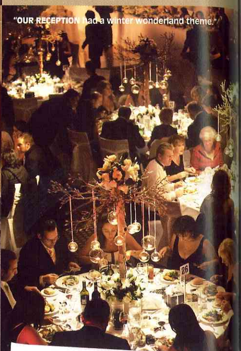
"OUR RECEPTION had a winter wonderland theme."