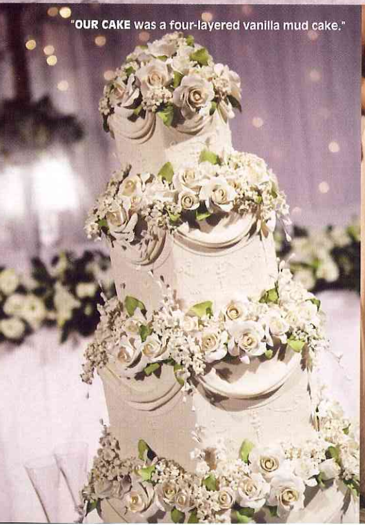
"OUR CAKE was a four-layered vanilla mud cake."