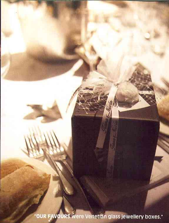
"OUR FAVOURS were Venetian glass jewellery boxes."