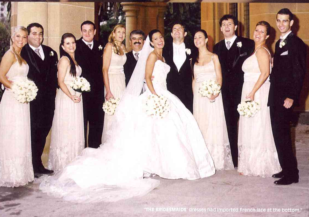
"THE BRIDESMAIDS' dresses had imported French lace at the bottom."